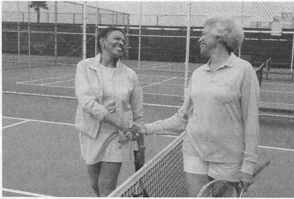
Shaking hands may be a polite acknowledgment of your competitor as well as a greeting.

20 The pressure to compete causes Americans to be energetic, but it also places a constant emotional strain on them. When they retire, they are at last free from the pressures of competition. But then a new problem arises. Some may feel useless and unwanted in a society that gives so much prestige 7 to those who compete well. This may be one reason older people in the United States sometimes do not have as much honor and respect as they have in other less-competitive societies. In fact, generally speaking, any group of people who do not compete successfully—for whatever reason—do not fit into the mainstream of American life as well as those who do compete and succeed.