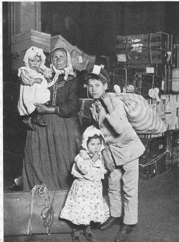
Immigrants on Ellis Island around 1900