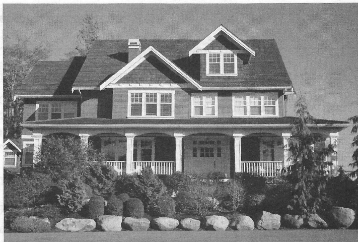
To some, owning a beautiful house means they have achieved the American Dream.

32 In the next three chapters we will examine three historical factors that reinforced and helped to shape these values: the religious heritage, the frontier heritage, and the heritage of abundance. The remaining chapters will explore how these values appear in aspects of American culture: business, government, ethnic and racial diversity, education, leisure time, and the family. The final chapter will discuss the challenges facing the United States and their potential impact on the future of the country and its values.