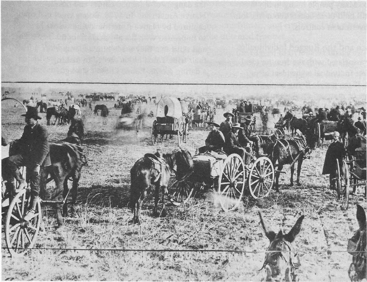
The 1889 rush to claim land in Oklahoma

was, they literally 2 raced into the territory in wagons and on horseback to claim the best land they could find for themselves.