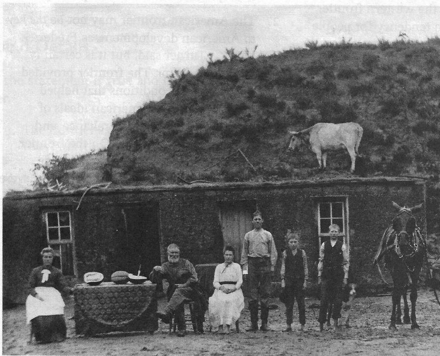
A nineteenth-century frontier family in front of their sod house

23 The willingness to experiment and invent led to another American trait, a "can-do" spirit, or a sense of optimism that every