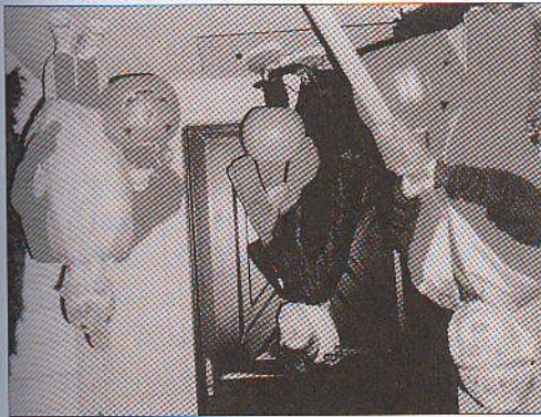
Children in Halloween costume

turkey with stuffing and gravy, sweet potato, cranberry sauce, and pumpkin pie. Sweet potato is a vegetable that looks similar to potato but has bright orange flesh. Besides these federal holidays, there are also various religious and traditional holidays that are not legally observed. One of them is Halloween, celebrated on October 31, on the evening before All Saints' Day. Children in both Britain and the US dress up as witches, ghosts, monsters, pirates, all kinds of scary creatures, and they knock on people's doors and call out "trick or treat!". The person at the door gives each child a treat, usually some sweets, that is, he "treats the children to some sweets". If, however, he refuses to give them something, they might play some small trick on him. At Halloween the windows of many houses are decorated with jack-o'-lanterns, that is, pumpkins that have been carved with strange faces and have a candle inside them. Both children and adults may have a Halloween party, where they play games.