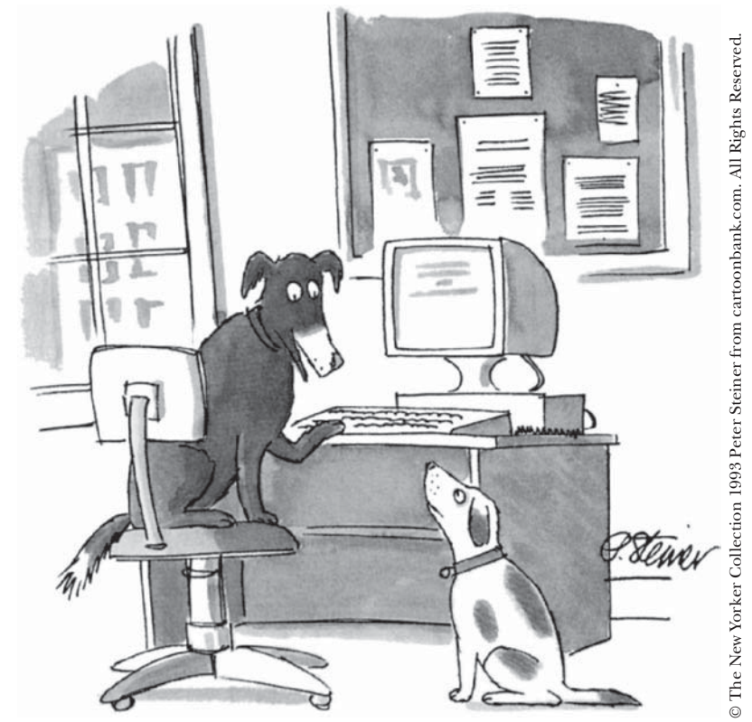
"On the Internet, nobody knows you're a dog."

The author of the following research paper used many features of MLA style to document her paper. Adhering to MLA style, she did not include a title page with her paper. Instead, she typed her name, her instructor's name, the course title, and the date on separate lines (double-spacing between lines) at the upper left margin. Then, after double-spacing again, she typed the title of her paper, double-spaced, and started the first line of her text. On page 1 and successive pages, she typed her last name and the page number in the upper right-hand corner, as recommended by MLA.